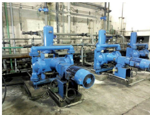
All pumps are equipped with frequency controlled motors.

The Bottrop purification plant was built between 1991 and 1997 by EMSCHERGENOSSENSCHAFT at the location of the former Emscher river purification plant. In Bottrop, the sewage of about 1.34 million population equivalents is purified in the plant. This is equivalent of the sewage produced by about 650,000 inhabitants and the same quantity of industrial sewage. The Bottrop purification plant is therefore one of the largest purification plants in Germany. The downstream central sludge treatment plant of EMSCHERGENOSSENSCHAFT (ZSB) is used to process and use the entire sewage sludge generated in the purification plants Duisburg-Alte Emscher, Emschermün-