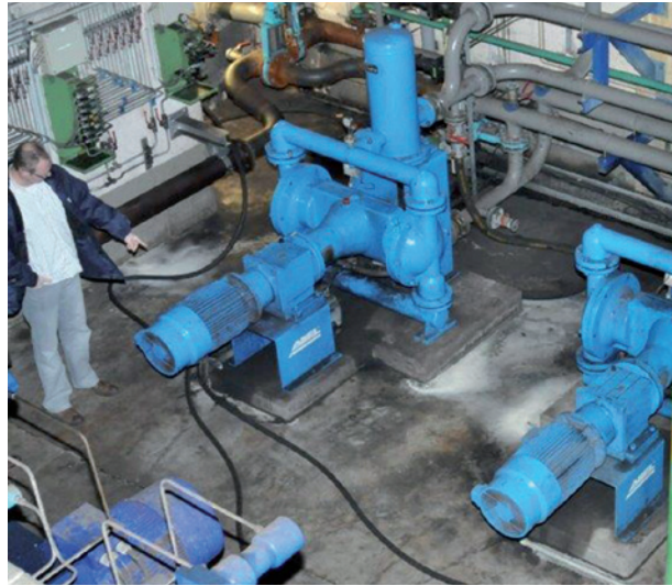
High volume pulsation dampeners provide a low pulsation performance of the pumps.

Until the end of the 1990s, the ZSB Bottrop used hydraulically driven piston pumps to transport the mix of coal and digested sludge from the fermentation containers. In 2000, these were replaced by three electromechanical ABEL Diaphragm Pumps of the EM 100Z1850-SG type. Higher efficiency and lower consumption of spare parts were decisive factors to do so. The pumps have flap valves that permit coarse coal particles as well as larger incrustations that often loosen from the wall of the mixing containers to pass. From the mixing containers, the pumps transport the coal-sludge mix directly into the main flow which leads through a static mixer to the mixing and fermentation containers of the filter press feeding pumps.