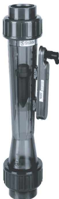
Flowmeter With Float DFM